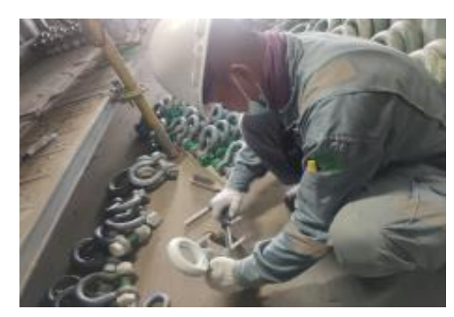
Team C & D