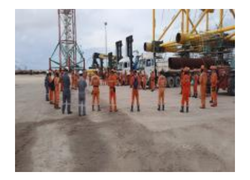
Tool Box Meeting